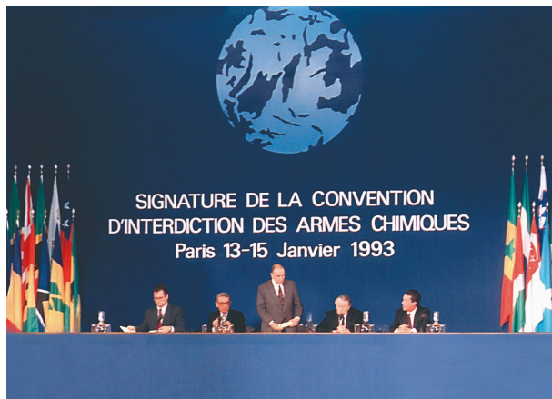
Opening for signature (1993) OPCW

As of July 2021, the CWC comprises 193 states parties. With this it is the world's most successful weapon control treaty. Only four states still need to ratify or accede to it: Egypt, Israel, North Korea and South Sudan.