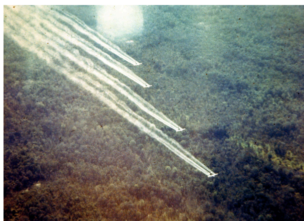
Operation Ranch Hand: Spraying Agent Orange to deny the enemy jungle cover during the Viêt-Nam war in the 1960s.

... the intentional application for hostile purposes of toxic substances against humans and their environment.